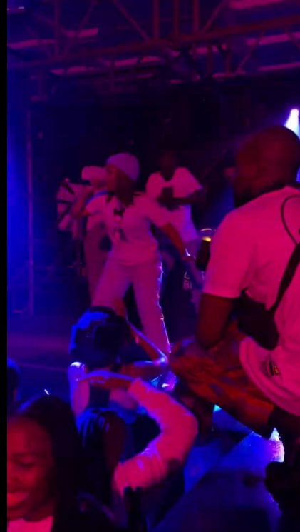
PABI COOPER PERFORMANCE

THE VIDEOS SHOW EXCITING AMAPIANO ACTS SUCH AS PABI COOPER AND FAKE LOVE, INCLUDING FOOTAGE OF THE KI KI BALL CONTESTANTS AND DURBAN GQOM PIONEERS UNTICIPATED SOUNDZ (PREVIOUS SLIDE).