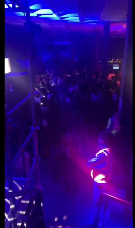
FAKE LOVE PERFORMANCE