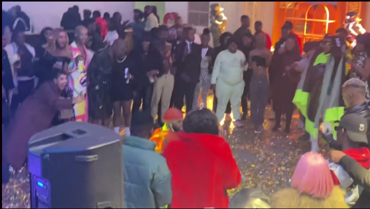
BALLROOM CATEGORY OTA

THIS PROVIDED A NOVEL ENERGY INTO QUEER NIGHTLIFE AS WE KNEW IT, GIVING A FUN AND LOOSE VIBE, BUT STILL RETAINING CORE TRADITIONAL ELEMENTS OF BALLROOM CULTURE SUCH AS CATEGORIES, TROPHIES, JUDGES AND HIGHLIGHTING WOMEN AND QUEER PEOPLE ON THE PERFORMANCE LINE UP.