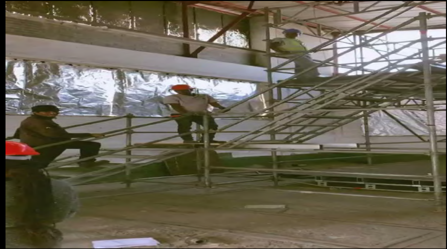
STRUCTURE BUILD UP LIVE PRODUCTION DAY 1