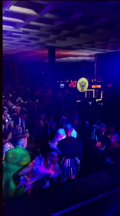
BALLROOM CATEGORY OTA