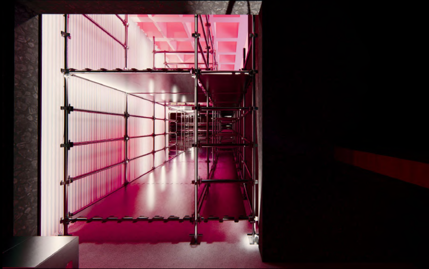
VEILED PLATFORMS 3D RENDER